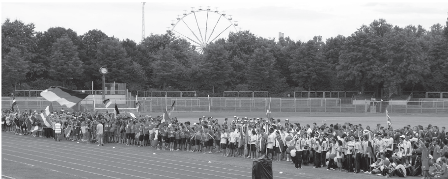
19 nations together in Heilbronn's Discraft Arena