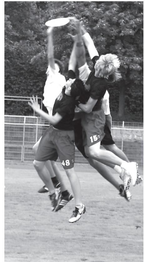
„all eyes on the disc“